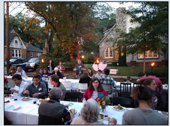
Community Events in Historic Melrose

Check out the recently launched Historic Melrose website at http://www.melroseneighborhood.org/ .