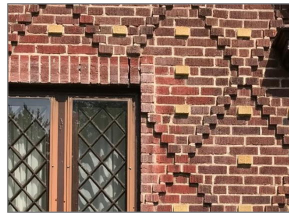
This Tudor Revival Style house in Melrose Heights uses brick diapering and colored bricks for a highly decorative effect