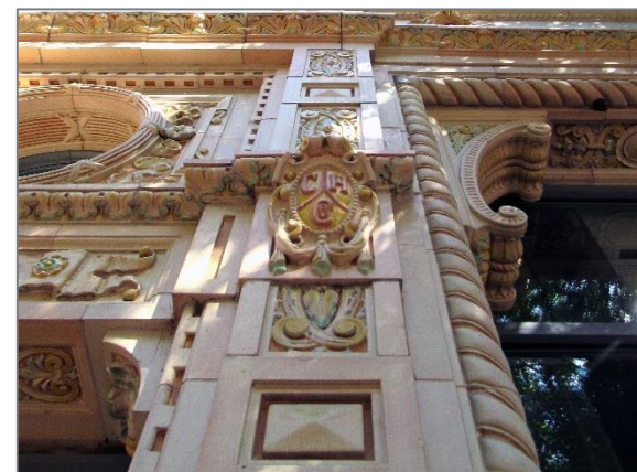
This decorative colored terracotta façade is all that remains of this historic Main Street building