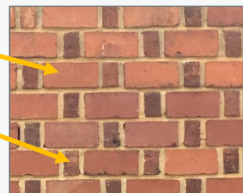
Flemish bond, seen on a home in Cottontown