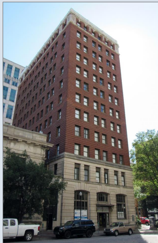
Guignard brick was also used in the construction of the National Loan and Exchange Bank Building, Columbia's first skyscraper.

As brick production became increasingly mechanized, it became more durable and affordable than its 19 th century counterpart. These factors caused a rise in the usage of brick as an applied material in residential construction. Think of neighborhoods like Cottontown or Melrose Heights with their relatively large number of brick structures compared to slightly older neighborhoods like Elmwood Park.