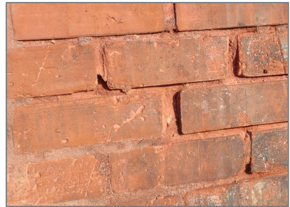
Although highly deteriorated today, the historic mortar was originally colored to match the brick

Sawtooth brick, like diaper brick work, is a decorative pattern. In this design, bricks are laid at an angle, creating a regular, zig zag pattern. Sawtooth pattern can often be found at the top of commercial buildings or along roof lines. Sawtooth brick can be found locally on commercial buildings in the Vista.