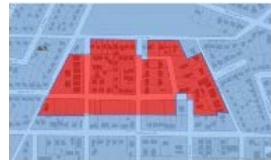
A “donut hole”

A donut hole is a property or group of properties entirely surrounded by the City (or in some cases, the City and another town or city). These are often areas that were developed prior to being adjacent to the City limits, and result in a patchwork of City, County, and private services in the area.