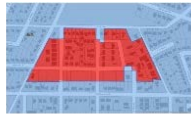
A “donut hole”

A donut hole is a property or group of properties entirely surrounded by the City (or in some cases, the City and another town or city). These are often areas that were developed prior to being adjacent to the City limits, and result in a patchwork of City, County, and private services in the area.