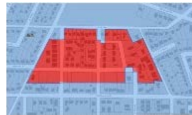
A “donut hole”

A donut hole is a property or group of properties entirely surrounded by the City (or in some cases, the City and another town or city). These are often areas that were developed prior to being adjacent to the City limits, and result in a patchwork of City, County, and private services in the area.